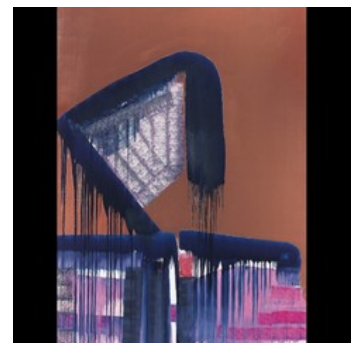
Monique van Genderen 15 Nov — 22 Dec 2018 at Miles McEnery Gallery