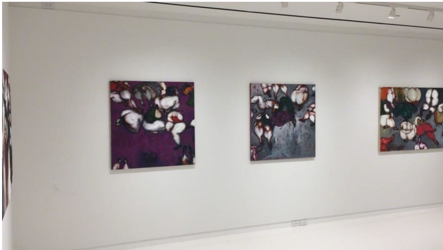
Uthman Wahaab. Courtesy of Sapar Contemporary

Sapar Contemporary is pleased to present Uthman Wahaab: Phenomenal Woman, a solo exhibition of work from the Languishing series. Exhibition will be open from August 16 to September 20, 2017. Opening hours in August are Tue, Wed, Thur. and in September Tue- Sat (11-6 pm).