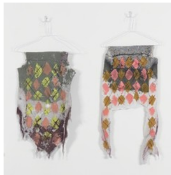
Solitaire 12 Jan — 24 Feb 2018