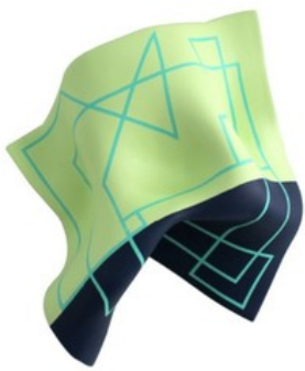
Marela Zacarias 6 Sep — 10 Nov 2018