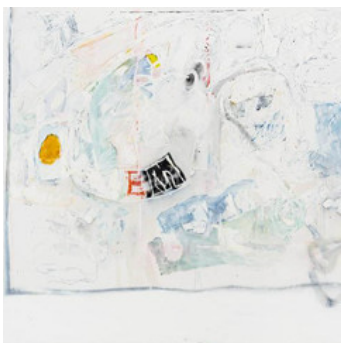
Eddie Martinez 14 Nov 2018 — 17 Feb 2019 at Bronx Museum of the Arts