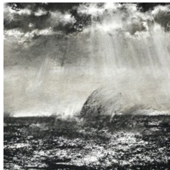
Phoebe Boswell 4 May — 20 Jun 2018