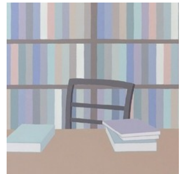
Cataloguing Time 10 Nov 2017 — 7 Jan 2018